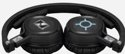
PXC 310 BT